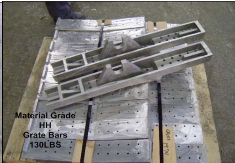
Material Grade HH Grate Bars 130LBS