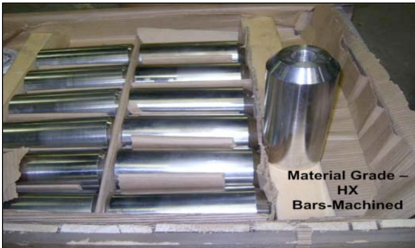
Material Grade – HX Bars-Machined

-CSC offers a Rapid Response, EMERGENCY BREAKDOWN SERVICE for quick delivery from pattern to casting to finished machined and CSC is available 24 hours per day, seven days a week