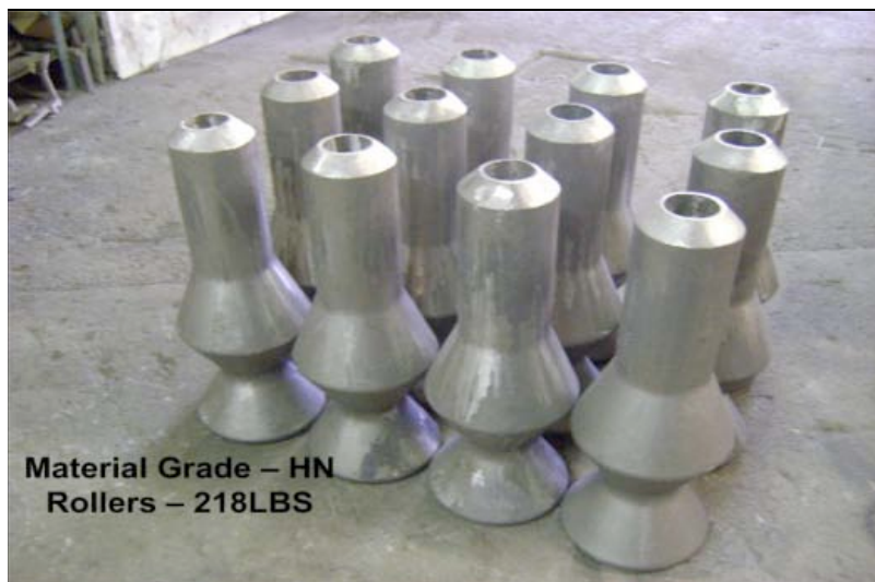
Material Grade – HN Rollers – 218LBS