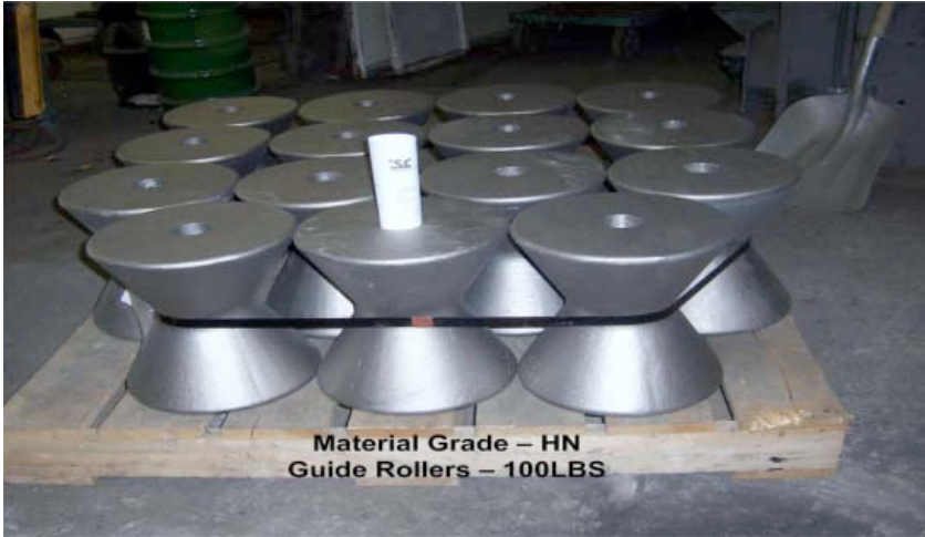
Material Grade – HN Guide Rollers – 100LBS